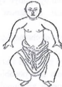
8. Sanpan Luodi Shi (san-pchan luo-ti š')