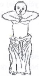
1. Weituo Xianchu Diyi Shi (wej-tchuo siang-čchu ti-i š')