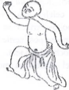
5. Daozhuai jiuniuwei Shi (tao-čuai tiou-niou-wej š')