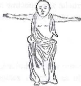
2. Weituo Xianchu Dier Shi (wej-tchuo siang-čchu ti-er š')