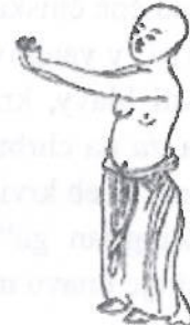
6. Chuzhao Liangchi Shi (čchu-čao liang-č' š')